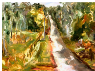
Winner Youthscape 2020 Gemma Rose Brook I like the sound of the gravel as I drive down this road just as much as I like to watch the shadows, colours and light change but mostly I like that it leads to figs, to morning coffee and to you.

For more up to date information please visit