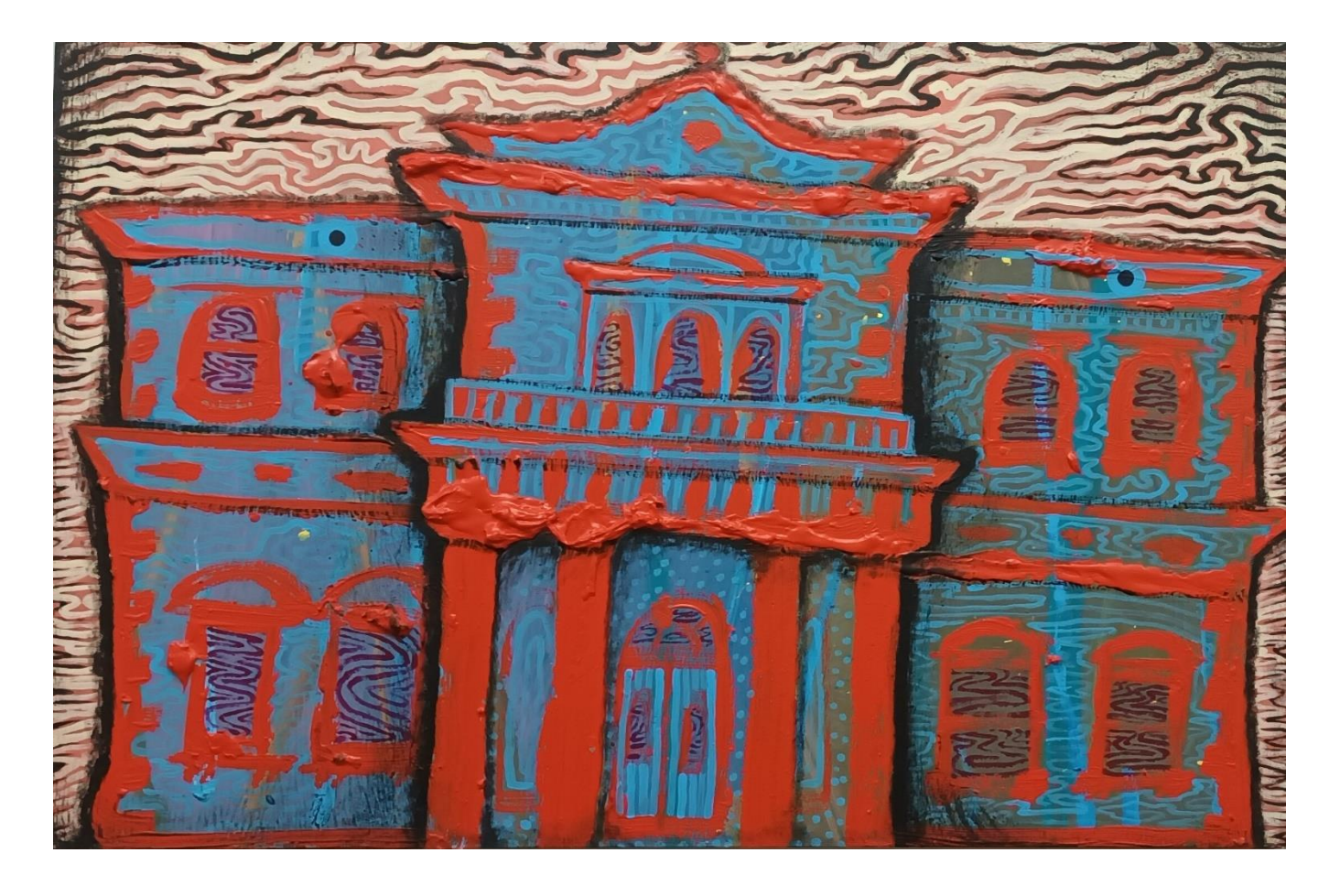
No 4. From Dan to Day, Acrylic on canvas, 161 x 93cm and below No 3 Activity, Acrylic on canvas 120x 150cm