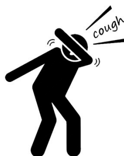
Cough into elbow